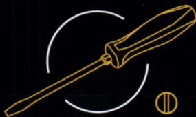
Standard Slotted Screwdriver